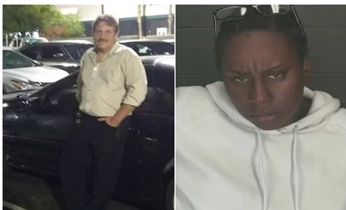
California grandpa, 59, is shot and killed