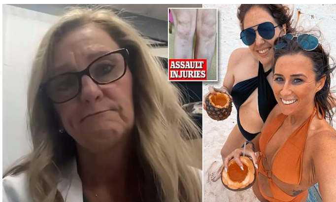
Nurse who treated Kentucky moms backs their account of Bahamas rape